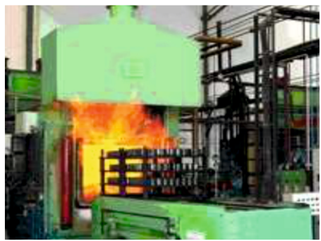
SEALED QUENCH FURNACE (1200L X 600W X 450H(MM))-1NOS SCADA CONNECTED