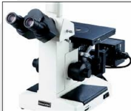
Metascope make Metallurgical Microscope