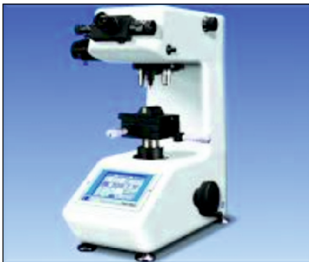
Fine make Vickers Hardness Tester with 50Kgs(max) capacity