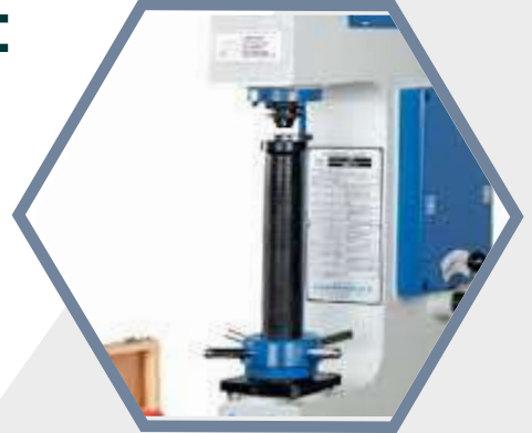
Fmi, Miraj make Rockwell Cum Brinell Hardness Tester with 187.5Kgs(max)