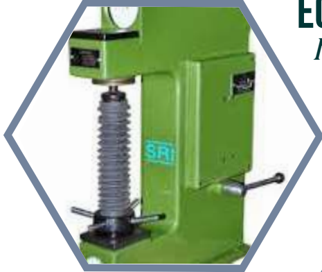
Akash make Rockwell Cum Superficial Hardness Tester with 150 Kgs(max) load