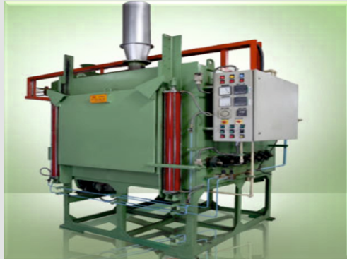
TEMPERING FURNACE (650H X 650W X 1200L(MM))-3 NOS

Ashwathy Make Furnace With 600kg Capacity And Electrically Heating Mode With Air Circulating Atmosphere