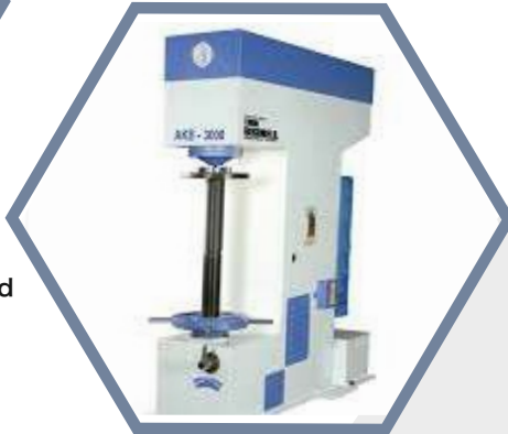
Fine make Brinell Hardness Tester with 3000Kgs(max) capacity