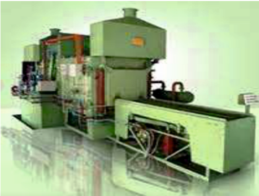
SEALED QUENCH FURNACE(1200L X 600W X 600H(MM))-3NOS WITH SCADA CONNECTED