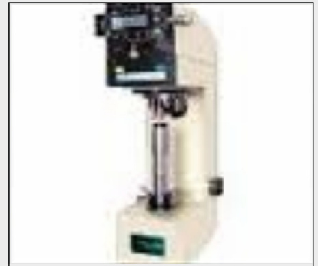
Everone Enterprices make Micro Vickers Hardness Tester with 1Kg (max) capacity